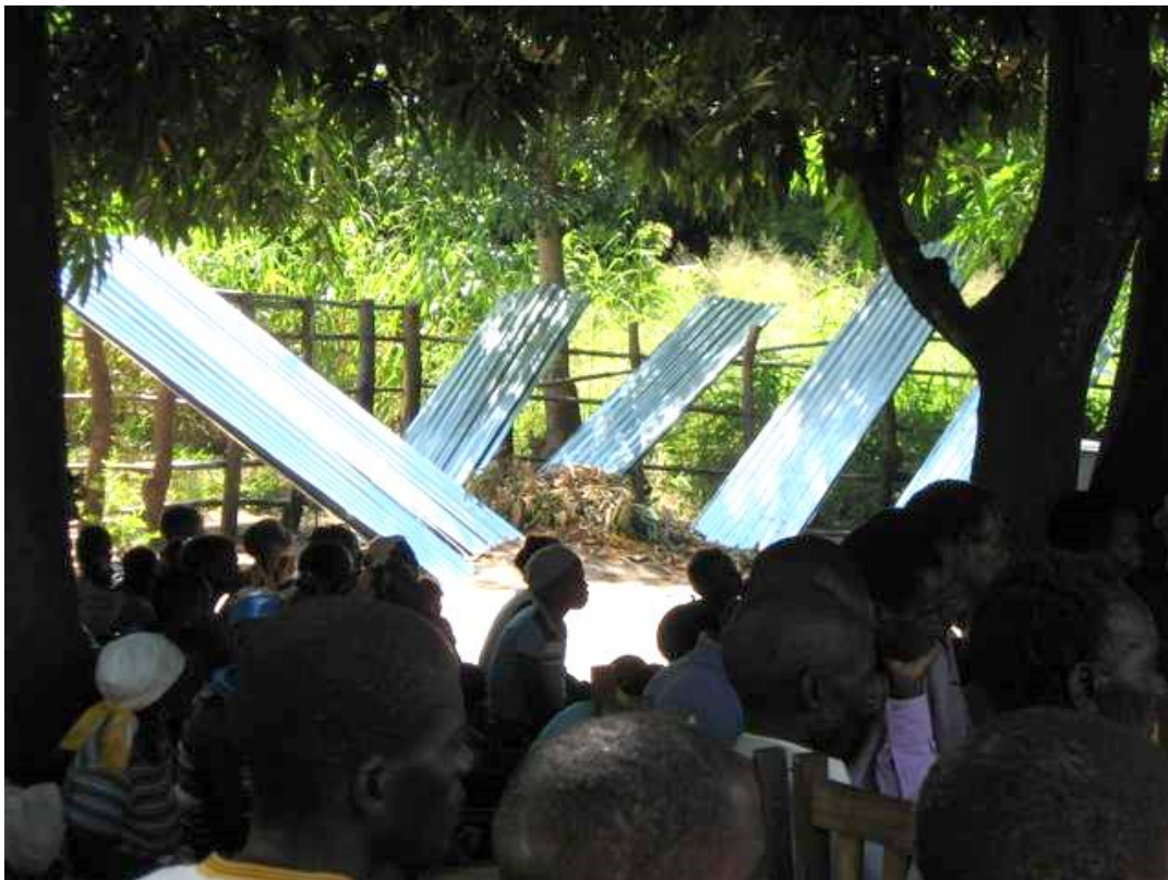
Tin roofs purchased on pay day.

The community bought 740 tin roofs which are much better able to resist the rains during the wet season and give families some stability in their houses. Seven people bought motorbikes, which will revolutionise their ability to access markets. Four people bought cement, 13 bought telephones, 2 bought generators, 17 bought bicycles, 1 bought a radio and 11 bought car batteries. One person even bought a TV.