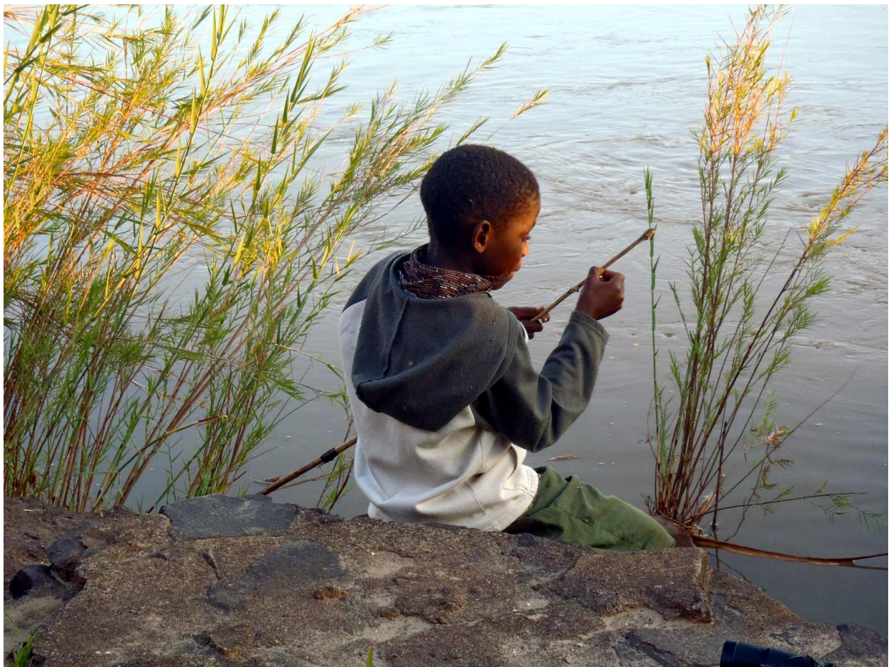
Picture: The next generation.