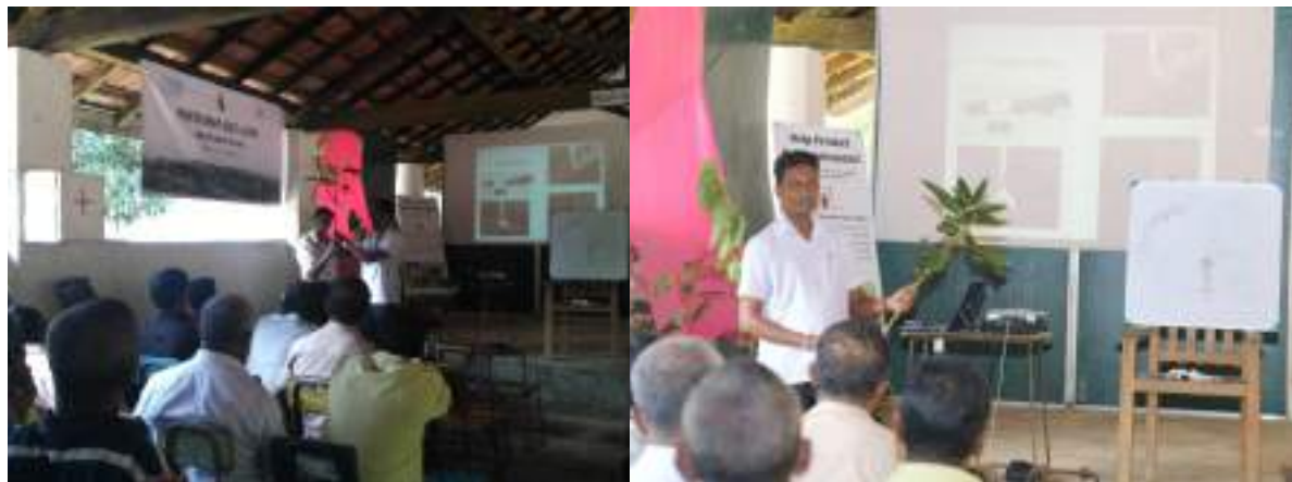
Figure 1: Plant budding session

Refer to Annex II for the agenda of the farmer training session.