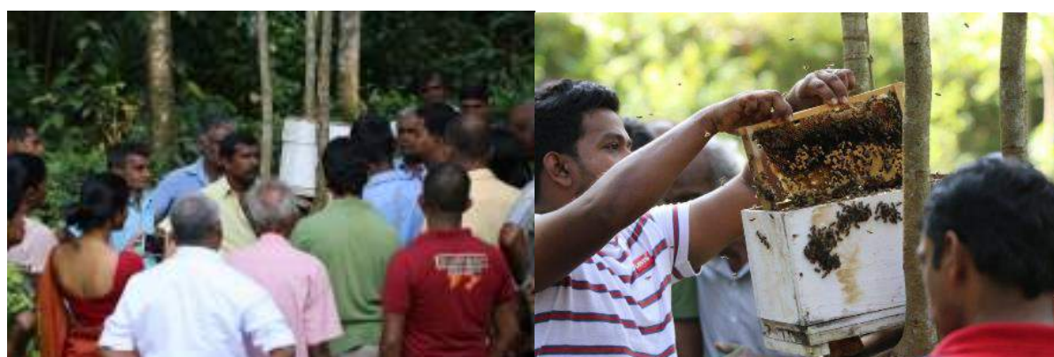
Figure 2: Beekeeping session