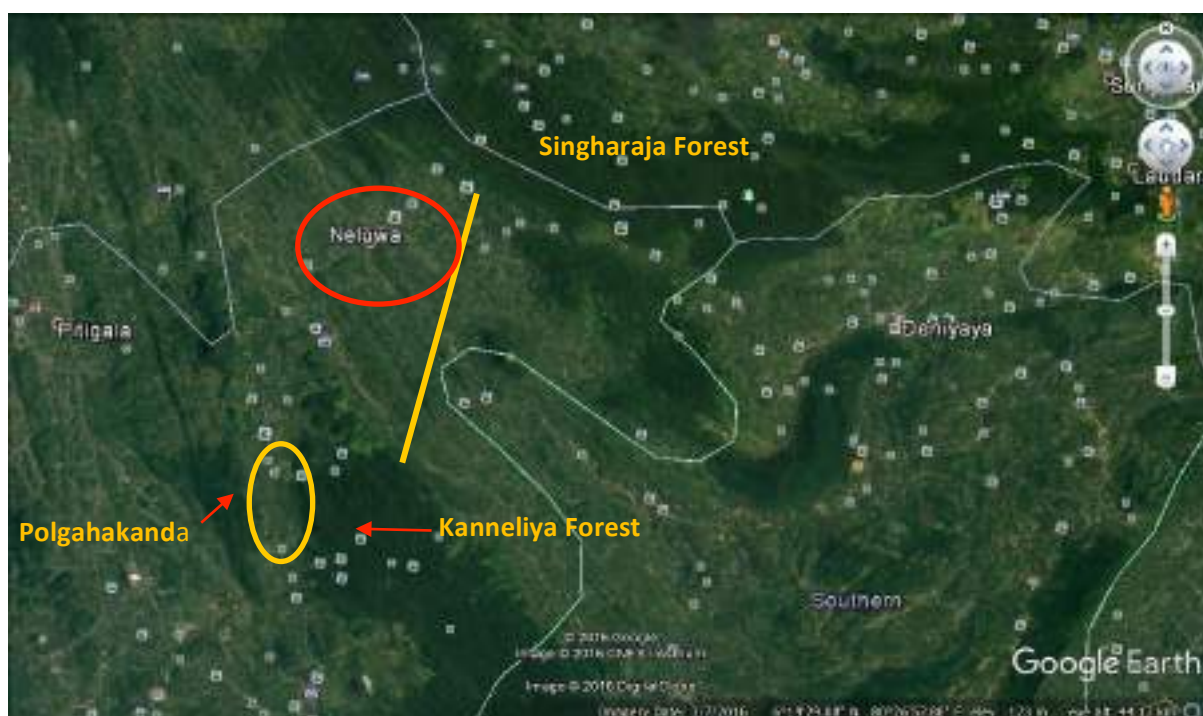
Figure 4: Location map of the Bio-link Project with selected area for expansion

Phases I and II of the plated lands are located between the Kanneliya Forest Reserve and the Polgahakanda forest patch. CCC is planning to expand the project between the Kanneliya forest reserve and the Singharaja rainforest to connect the three blocks of forest under Phase III of the planting process. CCC selected the Neluwa area following land surveys. The map below reveals the selected new area for expansion.