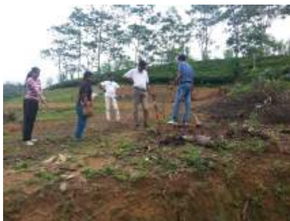
Figure 5: During the new land survey

Most of the farmers were not in favour of planting wild varieties on their farmlands. Much of the land in the Hiniduma - Neluwa areas is utilised for tea cultivation. When the monetary value of tea leaves increases, farmers will clear any bare land and convert it to suitable areas for tea cultivation. Therefore, CCC had to convince farmers about the importance of having an area allocated for forest trees and vegetation to sustain their tea cultivation as they experienced a lengthy dry period recently due to a shift in climate. CCC agreed to provide extra fruit / medicinal trees or those with timber value along with the wild varieties. However, from those additional trees, any species that are not included in the technical specification would not be considered in calculating carbon credit generation.