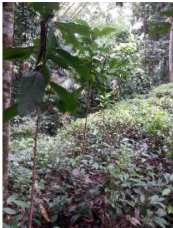
Figure 9: Trees planted along the boundaries of tea land