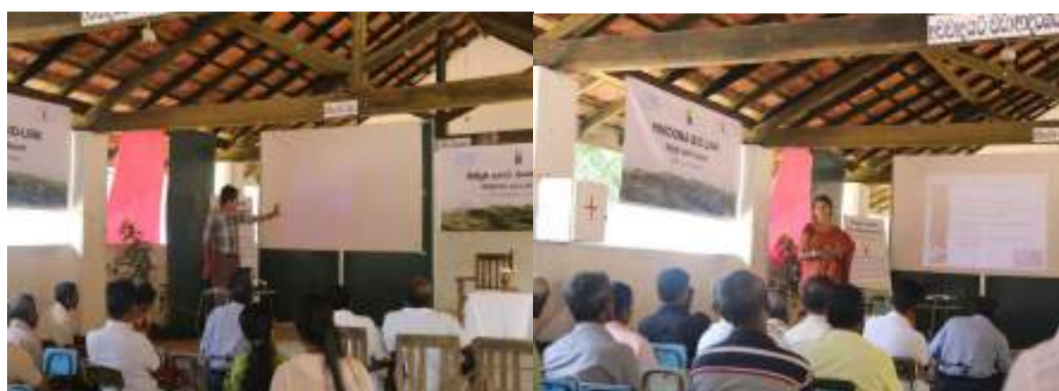
Figure 3: Awareness session