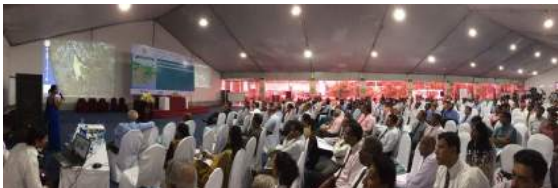
Figure 6: Presenting a paper on Hiniduma Bio-Link Project