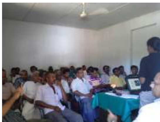
Figure 11: Farmer awareness session

In addition, CCC conducted a few awareness sessions in several village communities within the project area focusing on the importance of the Bio-link project as CCC plans to further develop the project next year. This contributes towards sourcing new land for the farmers and clears any misconceptions among producers.